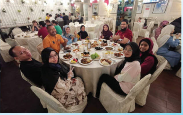
Buka Puasa among staff and family